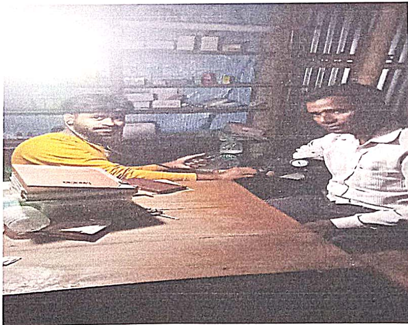
Plate 2: Different activities during survey of Non-Beteller Man of Bhagwanpur-II Block area