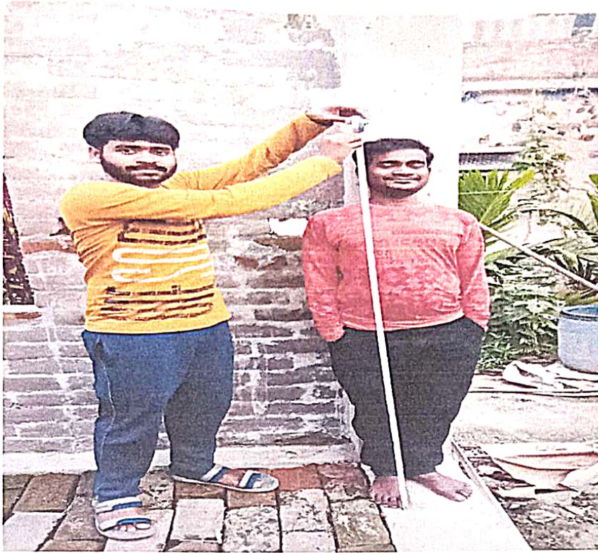
Plate 1: Different activities during survey of Beteller Man of Bhagwanpur-II Block area